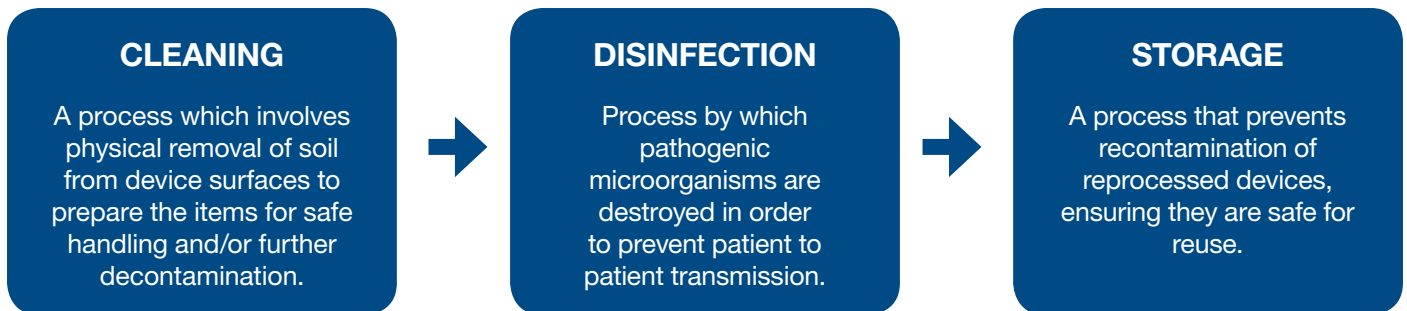
Figure 1. The stages of medical device reprocessing.

The term “reprocessing” is often used to describe one or all of the cleaning and disinfection steps. Manufacturer instructions as well as local regulations and guidelines should be referred to before commencing reprocessing to ensure the processes are compatible and compliant.